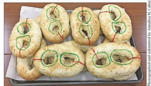
“Okay, who’s the genius that gave these bagels the wrong genus?”