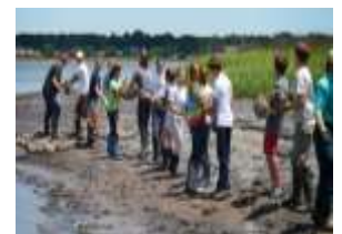
Volunteers building an oyster habitat.

All dates and times are tentative. Please confirm in advance! Call or email us at (843) 953-9068 score@dnr.sc.gov to sign up for an event and get directions to the site!