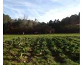
Rain or shine every Saturday!