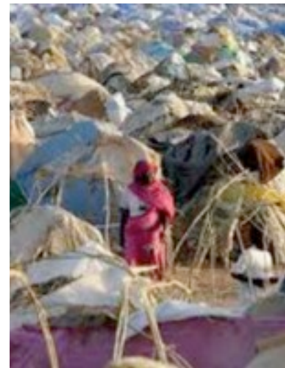
Congolese Refugee Camp, Zambia

Conclusion/Closing Remarks: Margaret Lally