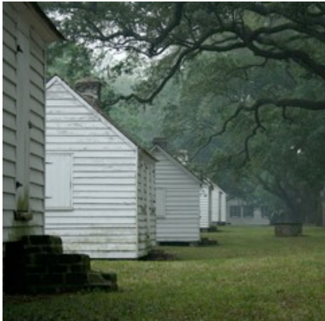
Slave Cabins next to Oak Allée, McLeod Plantation, Charleston