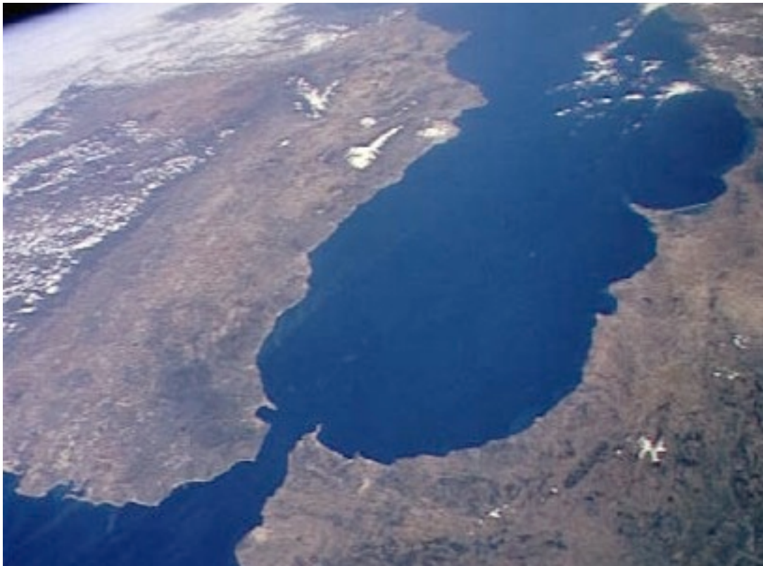
Aerial of View of Europe and Africa at the Strait of Gibraltar