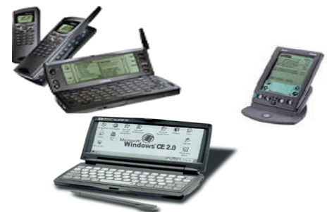
Figure 1. Various mobile computing devices (left to right: NOKIA 9110, Hewlett Packard 300 Series, 3Com PalmPilot).

The keyboard (physical or "soft") is not the most effective input device for every task. There exist many tasks that can be better performed through alternate modalities, such as point-and-click and speech. Nevertheless, since the keyboard is a de facto "universal" interface for general computing devices (i.e., the typewriter computer metaphor), it is a requirement on any mobile device that supports access to general computing. For instance, using a cellular phone with a keyboard interface a user can send e-mail or enter data into a spreadsheet stored on a remote PC.