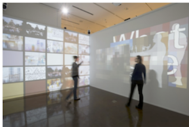
Figure 1. Specter system deployment at Time Jitters exhibit. Photo shows two people moving through the installation. Two of the four speakers are visible (top-left and center). Also visible is one of the two Kinect sensors used in the installation (top right), and one of the four projectors (each projecting to one of the four walls enclosing the installation).

Sound spatialization offers the ability to composers and performers to specify how sounds are positioned in the listener's audio field. Most consumer-quality audio systems allow for stereo fields (i.e., the ability to pan sound from left to right channel), becoming a standard household item in the 1970s. Around the same time, quadrophonic systems were introduced (i.e., making use of 4