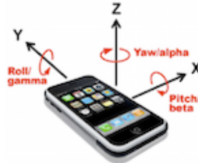
Figure 6. Smartphone Pitch, Roll, and Yaw directions.