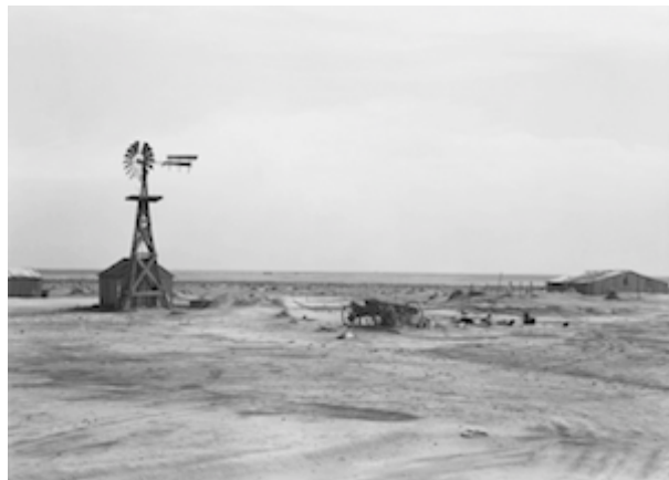
Figure 3b. Another of the photos used by the composer to provide aesthetic inspiration for composing the sonification scheme. Photo Credit: Dorothea Lange (1938), "Abandoned farm with windmill and farm equipment. Dalhart, Texas. June 1938" [19].

pattern (or left-to-right pattern, for 2 speakers), thus generating a "flying-around" of notes.