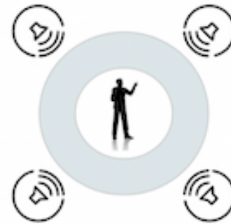
Figure 5. Migrant performance 4-channel speaker arrangement. Audience is seated in the middle. However, a regular two-speaker (stereo) setup is possible (for convenience).