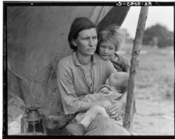
Figure 3a. One of several photos used by the composer to provide aesthetic inspiration for composing the sonification scheme. Photo Credit: Dorothea Lange (1936), "Destitute pea pickers in California. Mother of seven children. Age thirty-two. Nipomo, California" [18].

During the first cycle, the pianist plays the notes in the score verbatim. The computer layers identical notes in a computer-enhanced timbre and diffuses them in a circular