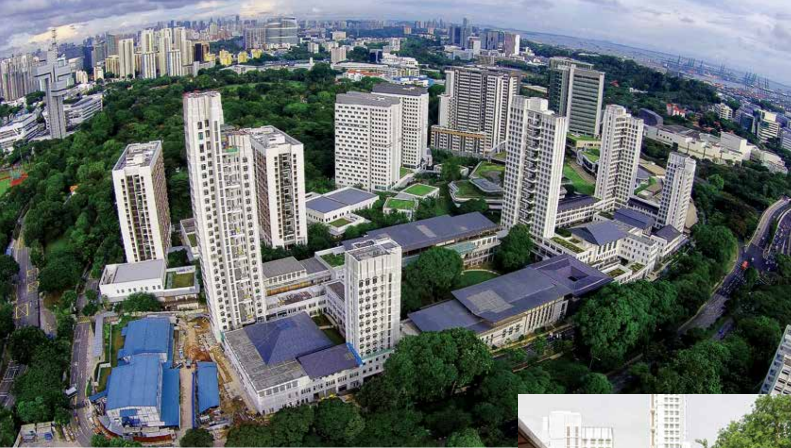
Above: The new campus, foreground, in front of NUS's residential towers; central-quad detail (right)