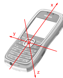
Figure 2. Orientation of tilt directions of accelerometers in a Nokia 5500 camera phone.

As a first illustration of the possibilities of using mobile phones as musical instruments we implemented a few basic gestures that are motivated by traditional musical instruments and also relate to earlier work on using existing instrument paradigms in electronic instruments [1, 2, 4] where the idea is to retain familiar gestures for matching sounds.