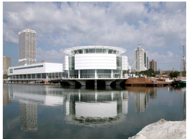
Discovery World at Pier Wisconsin

If you have not yet had the opportunity to visit our city’s newest public education venue in downtown Milwaukee you ought to. Discovery World at Pier Wisconsin certainly does not fit the mold of the typical science and technology museum of the 20th Century; indeed, being designated a museum at all makes some staff members uneasy. Whether you call it a learning center, an edifice of edutainment, a museum, or none of the above, the fact remains that stasis is not in Discovery World’s vocabulary. The overarching mission is to “connect innovation, science and technology with exploration, environment and water resources through experimental learning programs.” The role of archaeology education in this broader mission was only recently envisioned and has since become an integral part of program development.