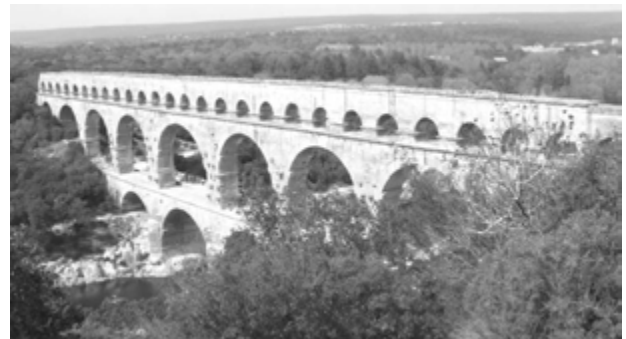
Pont du Gard, Aqueduct Bridge, 1 st Century B.C.