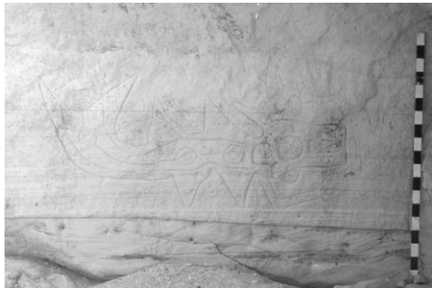
Mythical Whale Petroglyph, Nasca Valley, Peru

The Grande River System in Peru's Department of Ica is best known for the large scale drawings on the desert floor collectively known as "The Nasca Lines." The name "Nasca Lines" is a broad generalization, however, often used to describe a wide variety of geoglyphs in various styles. In fact, geoglyphs of different types can be found not only in the Nasca Valley and the adjacent pampas (elevated plateaus), but also in the northernmost valleys of the river system. In recent years, the area's geoglyphs have been studied alongside smaller scale examples of rock art, i.e. petroglyphs. That research has taken place primarily in the Palpa Valley, where petroglyph sites are well-known.