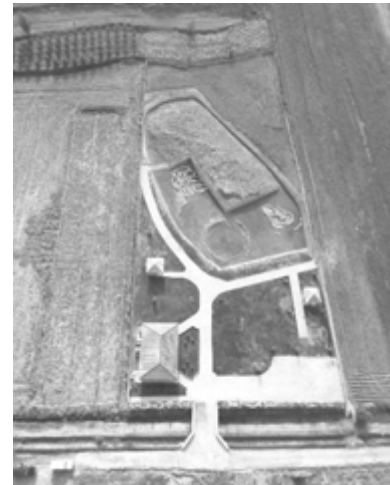
Aerial View of Burial Mound of Kamenica, Southeast Albania, 13 th - 6 th centuries B.C.E