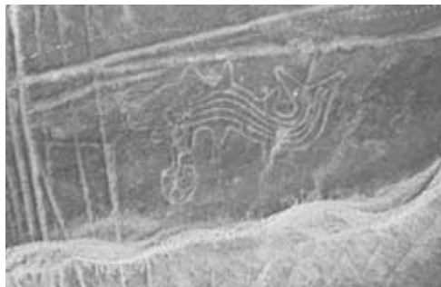
Mythical Whale Geoglyph, Nasca Valley, Peru

As part of her doctoral research, Nieves conducted a rock art survey of the Nasca Valley and was able to document 26 petroglyph sites in this valley alone. Nasca Valley petroglyphs were clearly comparable to Paracas