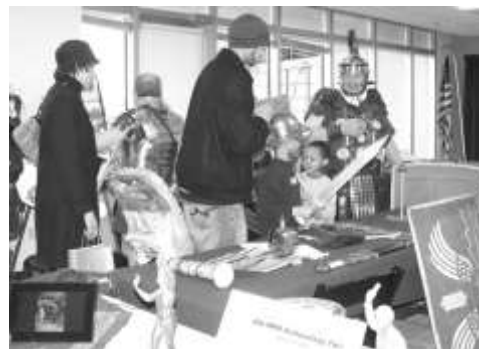
Trying on Roman Armor at the Milwaukee Archaeology Fair, 2010

the exhibition on "Mummies of the World" at the same time as the Fair. The exhibit runs from December 17, 2010 – May 30, 2011. You need a separate, timed ticket to enter the exhibit. Come and make a day of it and visit both the Fair and the Mummies!