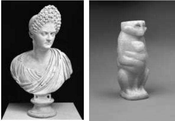
Artifacts from the San Antonio Museum of Art's "Art of the Ancient Mediterranean World" Collections.

For the first time in over 25 years the AIA's Annual Meeting took place in San Antonio, Texas. Attendees at the AIA's 112 th annual meeting, January 6-9, sampled the intellectual feast offered by the meetings themselves, and also took in some of the iconic sights of the nation's seventh largest city including the Alamo and the San Antonio Museum of Art. When not rushing to and from meetings they could also stroll along the famous River Walk and enjoy the many restaurants and shops that line it (though the water in the River Walk was drained for its annual cleaning during our visit).