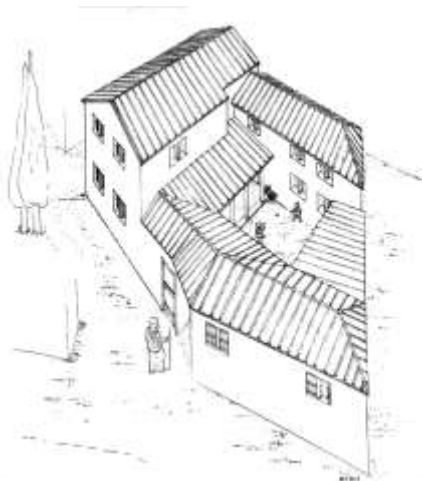
Typical Athenian Greek House

Sunday, April 10, 2011, 3:00 p.m. Sabin Hall, Room G90