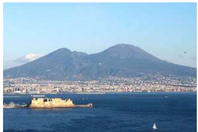
Mt. Vesuvius and the Bay of Naples Today