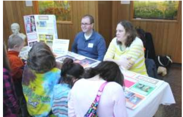
UW-Milwaukee Classics Club members explain Greek and Roman Art at the 2012 Fair

Come and meet the experts at the Fourth Annual Milwaukee Archaeology Fair! The Fair, co-sponsored by the AIA-Milwaukee Society and the Milwaukee Public Museum, will take place at the Public Museum on Friday March 1 and Saturday March 2 from 10:00 am to 3:00 pm both days. Admission to the Fair is free with regular admission to the Museum.