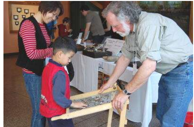
Sifting Finds at the AIA's Archaeology Fair in Seattle