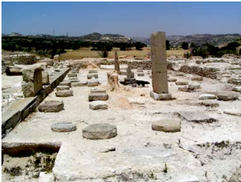
Pithos Hall, Building X, Kalavassos.

Sunday, March 6, 2016 Sabin Hall Room G90, 3:00 p.m.