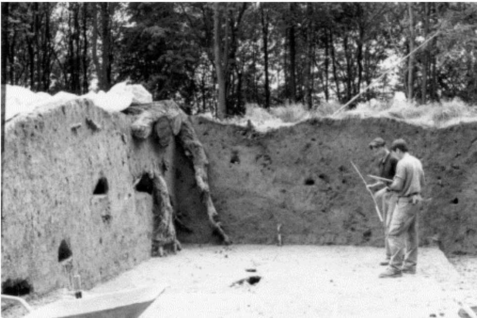
Tumulus 17: Iron Age Burial Mound, Germany