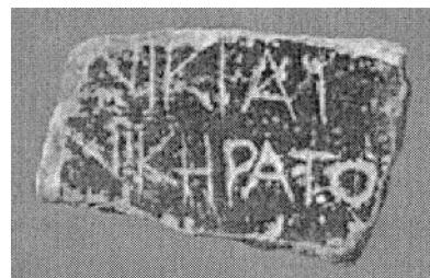
Ostrakon of the Athenian general Nikias