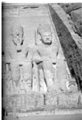
The Great Temple at Abu Simbel of Ramses II