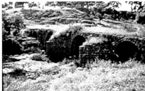
The Southern Bridge at Torre de Palma