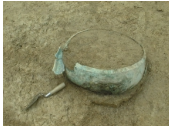
Bronze cauldron recovered at Tumulus 17