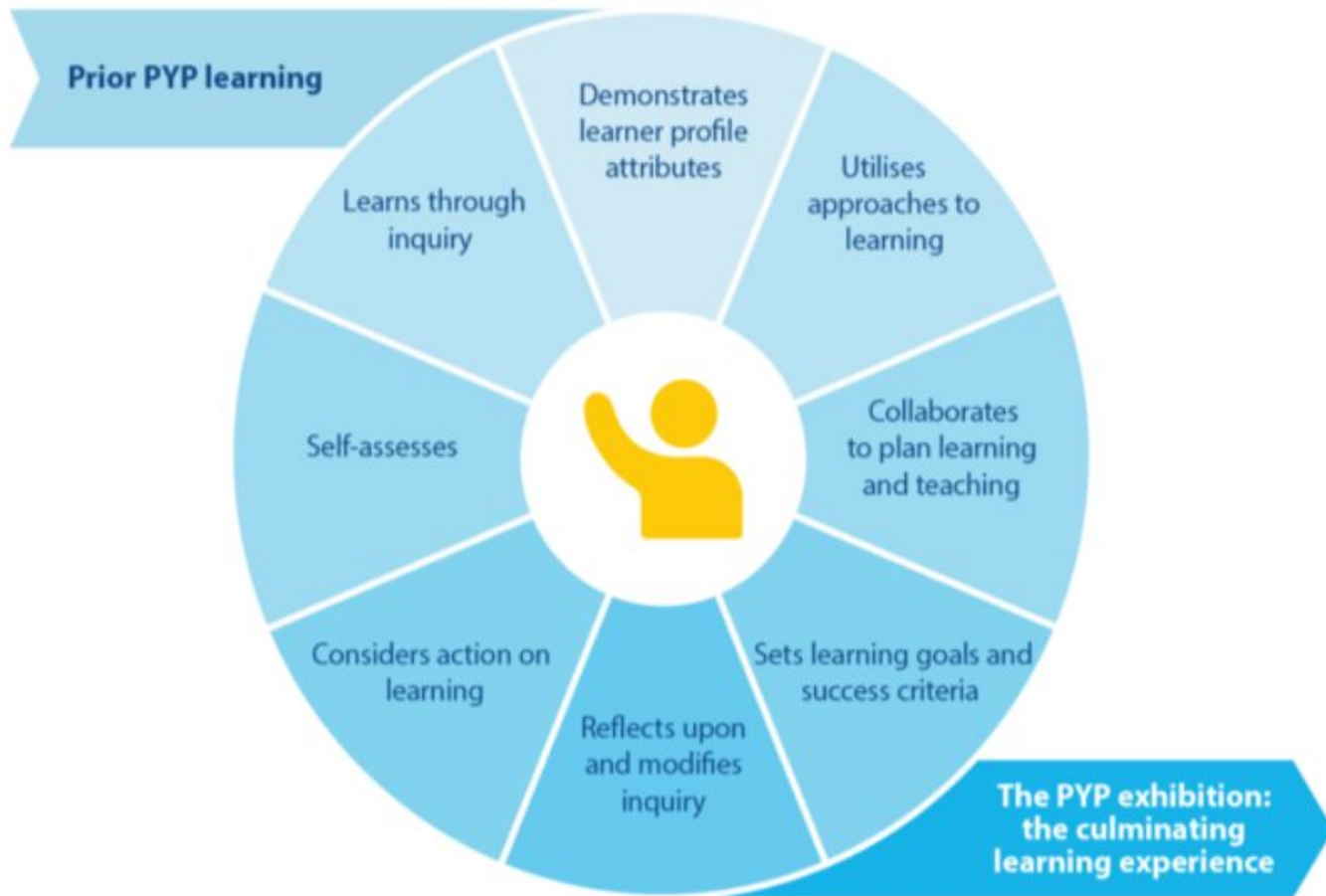
Figure EX01: The PYP exhibition