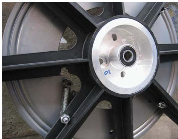
In-hub brake mounted into wheel