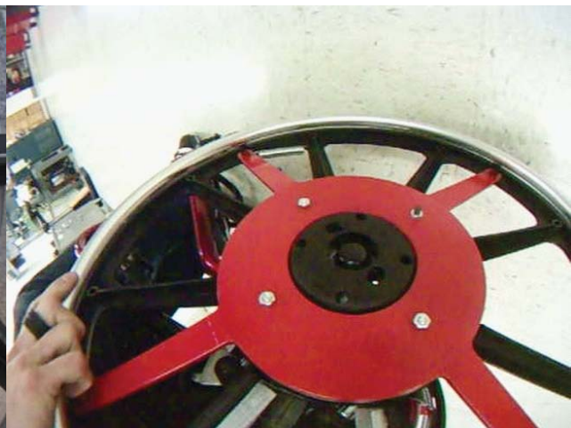
Complete in-hub brake assembly