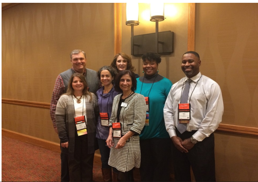
GMATYC Members at the AMATYC Conference in Denver November, 2016.