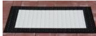
Figure 3. Plan view of outdoor testing area where participants viewed Detectable warnings on four simulated sidewalk sections

White with Black Border (4-inch wide border)