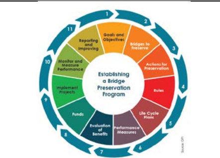
Figure 15. Steps for establishing a bridge preservation program.