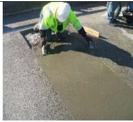
Concrete Deck Patching