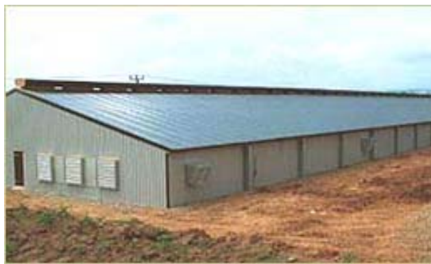
Figure 2. Typical Modern Poultry House

Depicted below is a typical modern poultry house of steel construction. Note several fan installations on the side wall used for cooling and ventilation. Note also the considerable exposed roof area, suitable for PV installation.