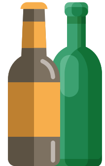
Glass & Beverage Bottles