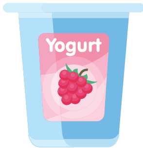
Yogurt Cups (clean)