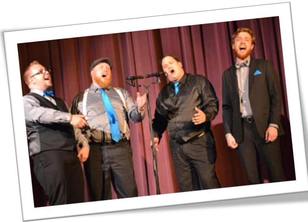
↑ Brew City Buzz