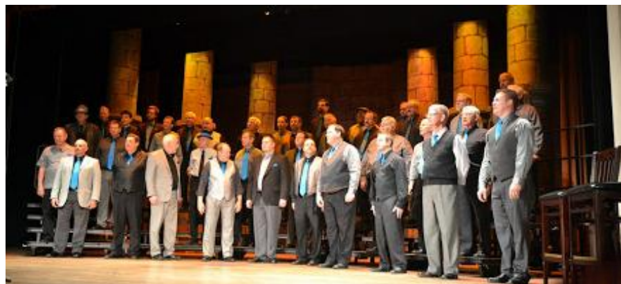
MVE at the Humphrey Scottish Rite Auditorium