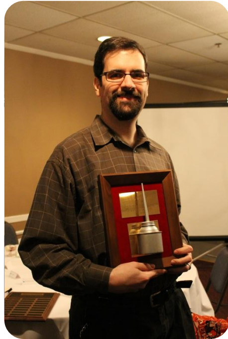
The Do It Award