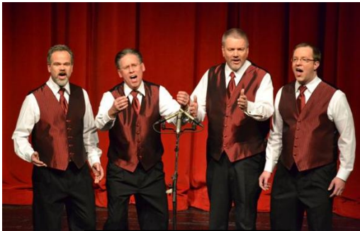
N th Degree