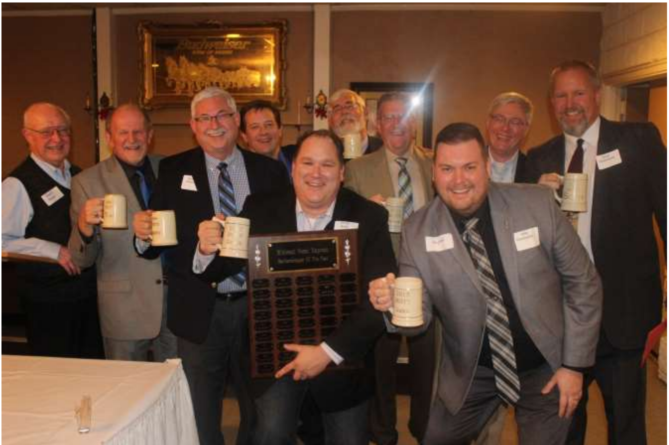
BOTYs know how to celebrate!