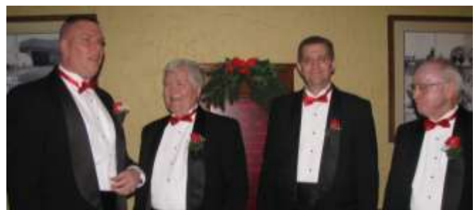
Locked & Loaded Quartet in 2008

MVE says: We are so very happy to have you with us, Niel.