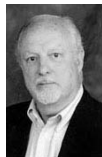
Dr. William G. Dever

The traditional God of the Hebrew Bible is portrayed as the only deity in ancient Israel, and is always presented in exclusively male language and imagery. Recent archaeological discoveries, however, have brought to light other deities that were widely venerated, both in folk or popular religion and in the official cult. This illustrated lecture will focus