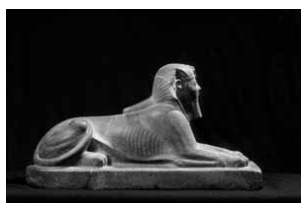
Sphinx of Thutmose III; 18 th Dynasty, 1479-1425 BCE; granodiorite; The Egyptian Museum, Cairo.