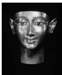
Funerary mask of Wenudjebauendjed; 21 st Dynasty, 1039-991 BCE; gold; The Egyptian Museum, Cairo.