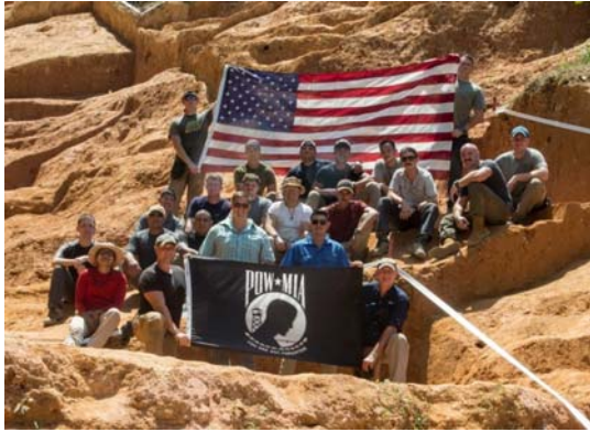
The author with recovery team at the end of mission field work.

providing them a better opportunity for recovering remains, which may be repatriated and identified at the DPAA state-of-the art labs. Regardless of field results and settings, the sites are challenging, engaging, and an honor to excavate.