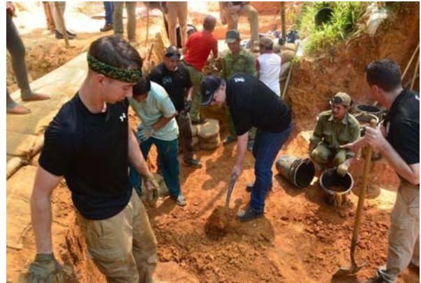
Site Excavation.

by how much humidity the August air of Vietnam's Central Highlands can absorb and hold. Fortunately, I will return to my air-conditioned hotel room and a waiting shower, while other colleagues will be "enjoying" a base camp, tent, and field shower. Regardless of our living arrangements, we are in Vietnam as part of a recovery mission sponsored by the Defense POW/MIA Accounting Agency (DPAA), which Congress created from existing, similar organizations in order to provide "the fullest possible accounting" to the families and the nation of the more than 82,000 Americans, who remain missing from WWII through the Gulf Wars.