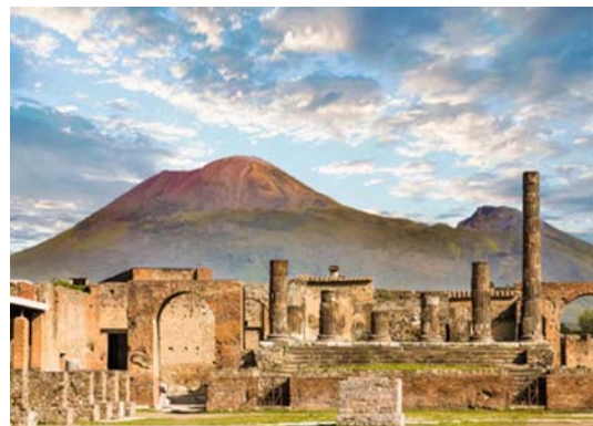
Pompeii with Mt. Vesuvius in the background