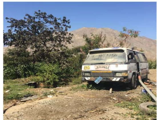
Combi bus modified to serve as water pump.

I spent most of June in Peru this year reconnecting with colleagues, collecting recent publications from Peruvian cultural organizations, and scouting archaeological sites for future research. Specifically, on that last point, I was ground-truthing research I've been conducting this past year with undergraduates at UWM. Throughout the academic year, we observe satellite images, digitize,