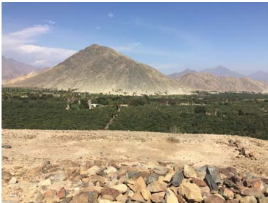
View of Cahuacucho from Tucushuanca.