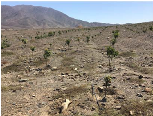
Recently-planted fruit trees in archaeological area.

Archaeological ethics should direct us to consider the needs of living people when implementing archaeological preservation efforts. Considering the needs of living, local people is especially important in rural areas where many of those living near archaeological sites are socially and economically marginalized. But in the case of middle-level agricultural encroachment, it is economically powerful groups that are taking advantage of local need and the lack of adequate archaeological supervision to increase their fields of products destined for export.