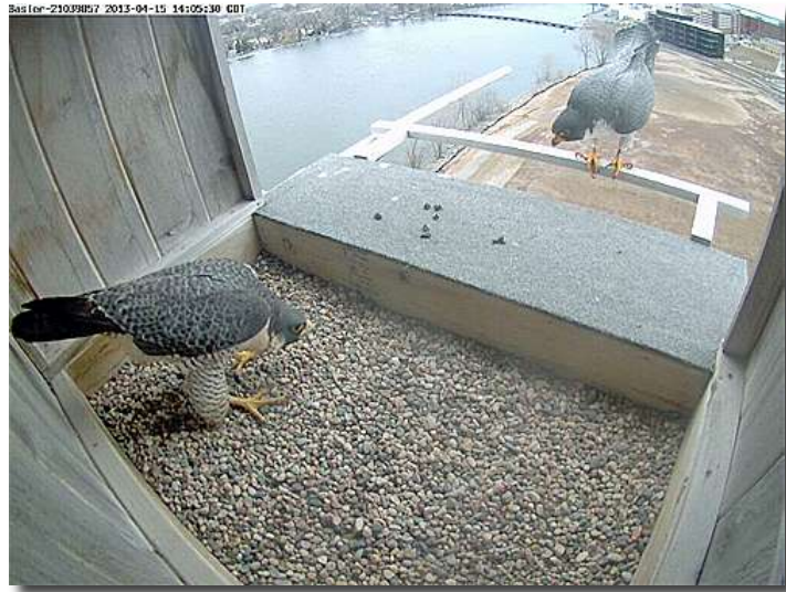
Above: A web cam image of an adult pair of falcons displaying at the Thermagen nest box on April 15 th

With the proximity of the Roland Kampo Bridge to the north, it's likely the falcons attempted nesting there once again.