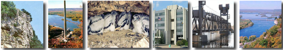
Photo Credits: BNSF RR Bridge - John Weeks, Eyass peregrines – L. Earl Bishop

Peregrines nested here in 1987 producing 3 young but didn't begin nesting again regularly until 2001. Since 2001, this site has produced a total of 29 young (2.23/yr.).