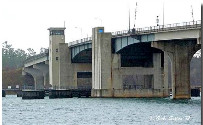
Above: The Bay View Bridge

Bridge tender Steve Graf reports the bridge resurfacing project that began last fall should be completed in August. He also mentioned that netting was being installed under the bridge to keep pigeons from nesting on the structure.