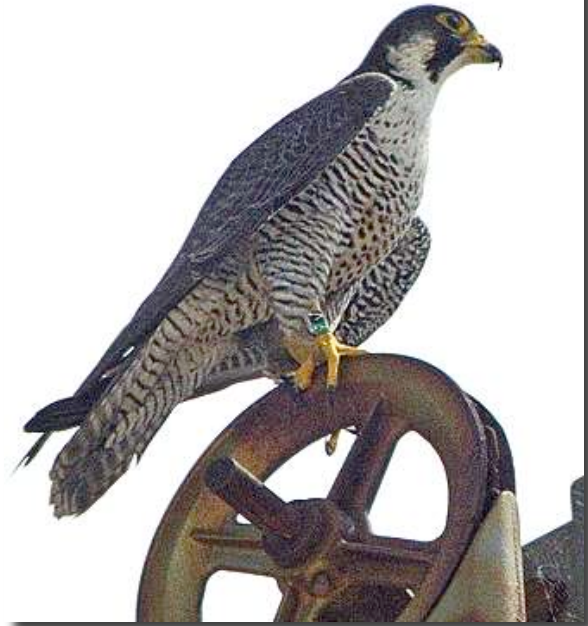
Above: “Indy Froona” (b/g) *V/*Y Left: Her four youngsters

Eggs: 4 laid between March 19 – 27 Projected Hatch Dates: April 26 – 28 Eggs Hatched: 4 between April 29 – 30 Banded: 4 males on May 20 Site Visit: May 20