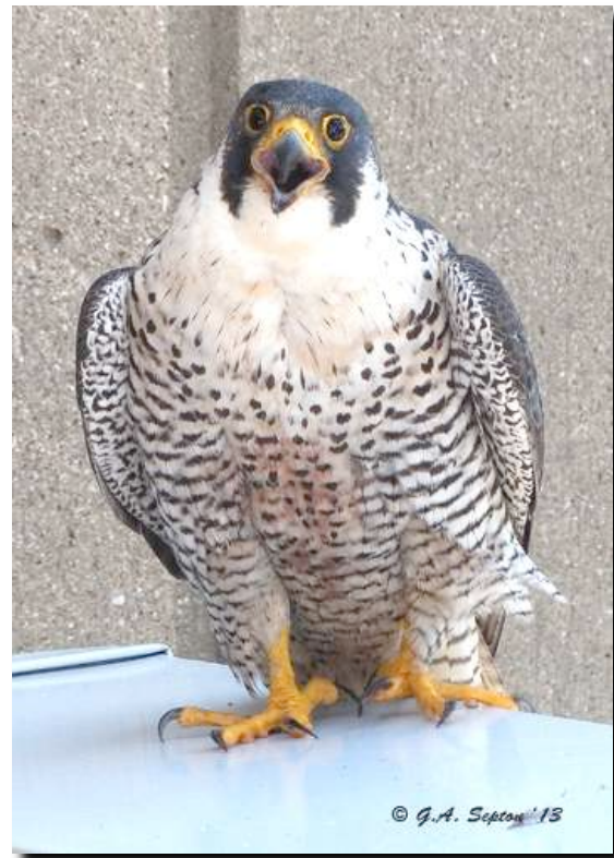
Above: The unbanded female