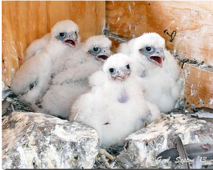
Above: The 4 youngsters back home after banding

This falcon was originally recovered in Ohio as an unbanded bird in juvenile plumage with a fractured left metacarpus (wing bone) and admitted to The Raptor Center on April 15, 2009. She was successfully treated and released on the St. Croix River in Osceola, WI on May 9, 2009. This is her 2 nd year at the Weston site but her first successful nesting attempt.