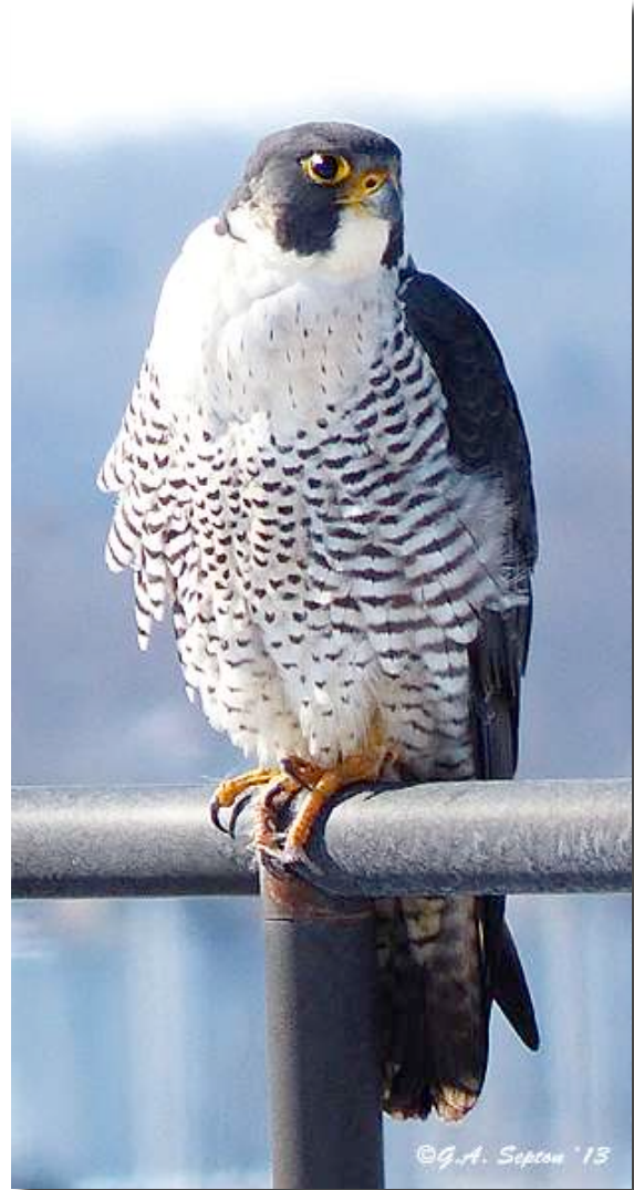
Above: The unbanded female

This site has been active since 1999 producing a total of 11 young (0.73/yr.).