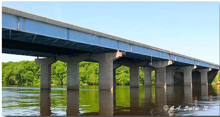
Above: The I90/94 Bridge as viewed from the east end looking west

With the Columbia Generating Station (where there is an active peregrine nest) approx. 5.5 miles upstream, it could be the falcon we saw here last year was one of the adults from the Columbia site and was using the bridge to hunt from.