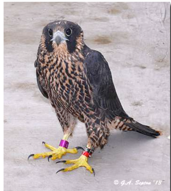
Above: Anna (b/r) 75/Y on the roof of the Valley Power Plant