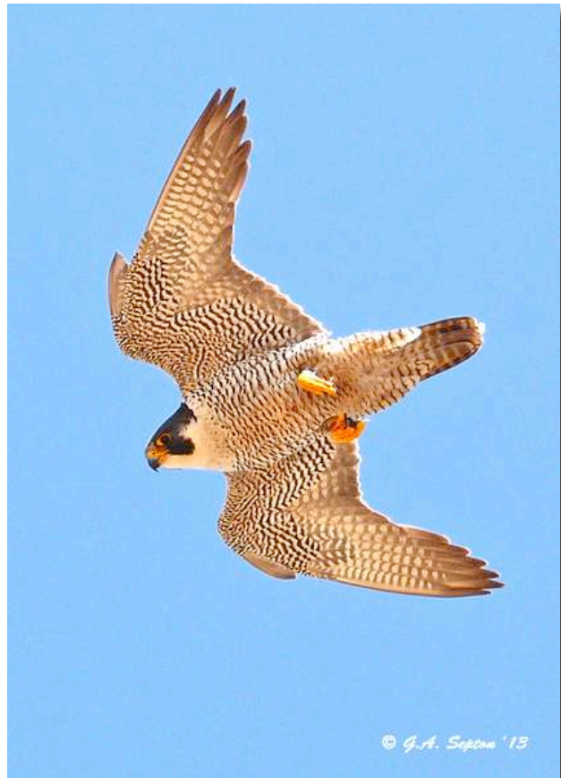
Above: P/63 – the adult female