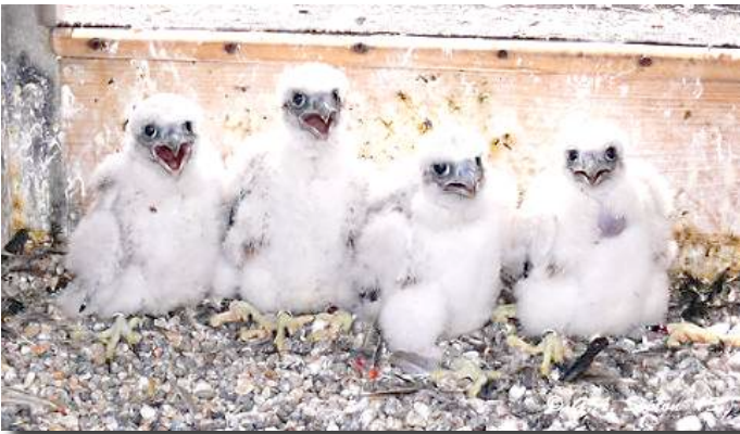
Left: Her 4 youngsters on banding day

This site has been active since 2007 producing a total of 21 young (3.0/yr.).