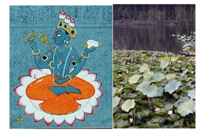
Figure 3 Painting of Hindu god Vishnu sitting on a Lotus as a symbol of purity (left) and lotus leaves emerging from water (right).

Indeed, the Lotus plant emerges clean from dirty or muddy water and serves as a symbol of purity in India and the Far East (Figure 3). The Hindu sacred text Bhagavad Gita 5:10 says