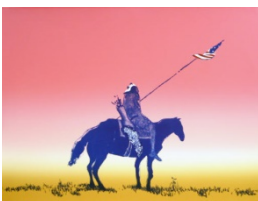
Fritz Scholder (American, 1937–2005) Indian with Flag , 1973 Lithograph, 30 x 39 in. Gift of Charles J. Weinraub, 1982 WU 1982.11