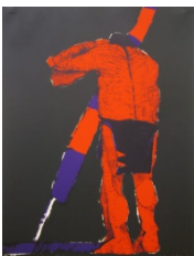
Fritz Scholder (American, 1937–2005) The Odyssey #2 , 1976–77 Lithograph, 30 1/4 x 22 1/2 in. Gift of Wanda and Thomas Taylor, 1981 WU 1981.29