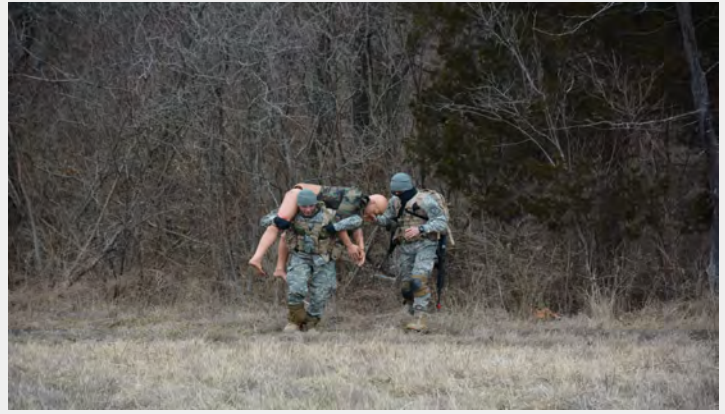
Above: Two Cadets simulate moving a battlefield casualty to a medical evacuation helicopter.

Gateway cadets spent two days in February participating in a superlab at the Weldon Spring Army Reserve Training Area. Despite temperatures ranging only between 8 and 22 degrees, Cadets made the most of their training opportunity. Friday was focused on land navigation and Saturday was spent practicing Troop Leading Procedures (TLPs) through Simulated Training Exercises.