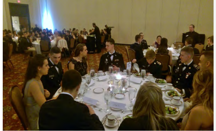
Above: Army and Air Force Cadets and their dates socialize with each other over a formal dinner.

Every year cadets of the Gateway Battalion attend a one of a kind event, an ROTC Military Ball. As a sophomore in the ROTC program with prior enlisted National Guard experience, this was my very first military ball with Cadets. At this event, I had the proud honor to be a part of the Gateway Battalion's Color Guard. The Color Guard is responsible for presenting the national colors at any formal event, accompanied by two ceremonial armed guards. It was a great honor to present them in front of other Cadets from different military branches, different universities, and some very important military officers.