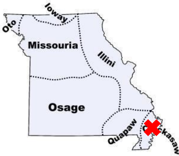
Figure 1: Six Tribes whose homeland was in the area of what is now called Missouri 8 Note: The Illini are just a small strip in the upper right. Much too much area shown here. Should be 1/3 the current width and 1/6 th the height. Additionally, there were no Chickasaw at the early dates. 3