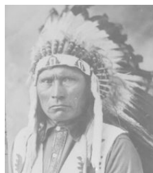
Chief Blue Jacket