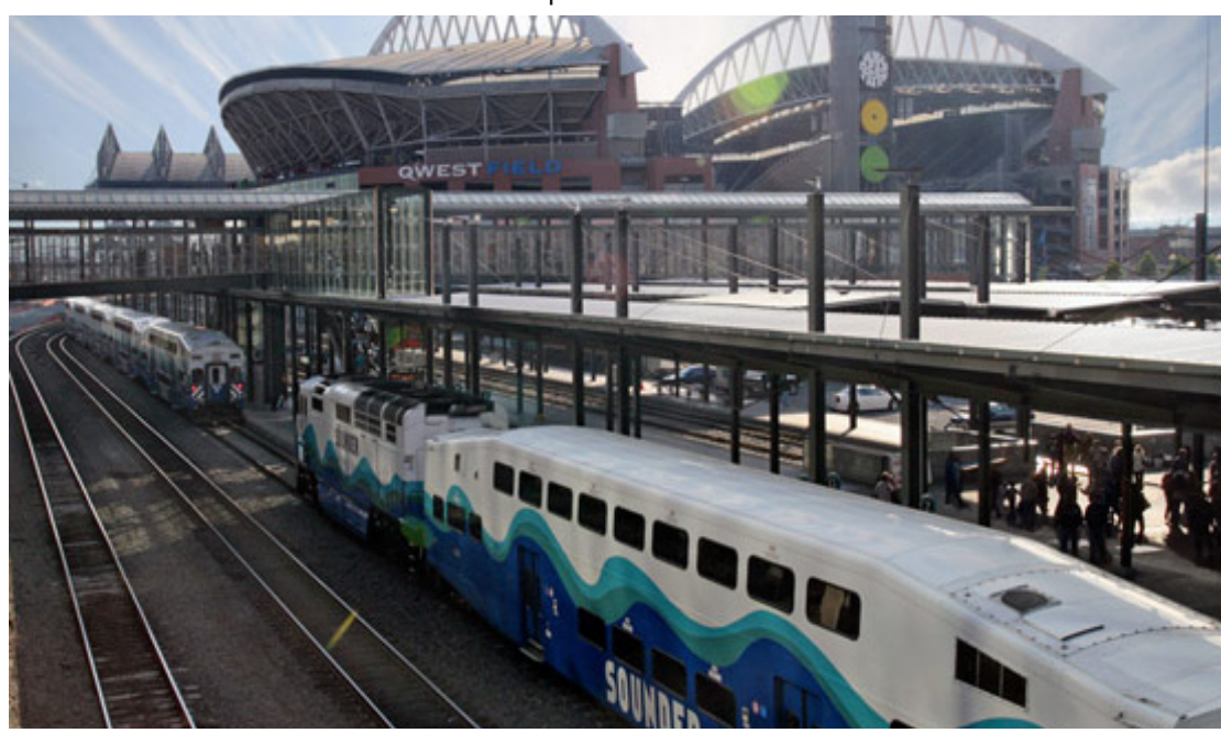
Union Station, Seattle

Due to GMA's comprehensive planning process, most opportunities for TOD are located in or near urban centers. Varying viewpoints influence definitions of TOD. Peter Calthorpe pioneered much of the thinking regarding how TODs are best designed. Calthorpe viewed TODs as a constellation of co-dependent centers inter-linked throughout a region by high-capacity fixed-guideway transit services. Typical TOD definitions are descriptive and often include a mix of uses, at various densities, within a half-mile (or quarter-mile) radius of each transit stop. However, there is little evidence that a prescribed set of uses or densities will deliver sufficient riders to support a functioning transit system.