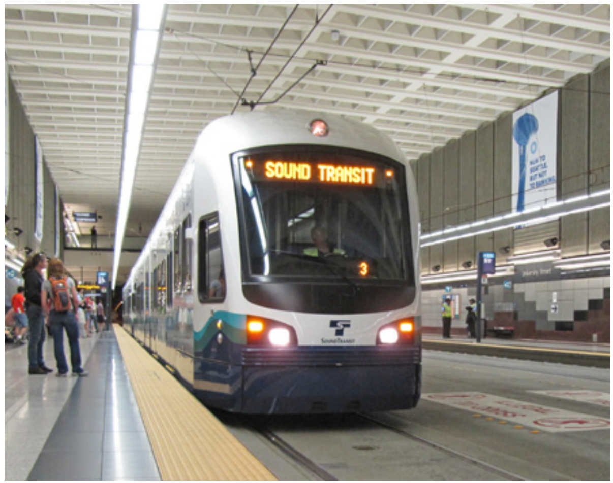
Seattle Transit Tunnel