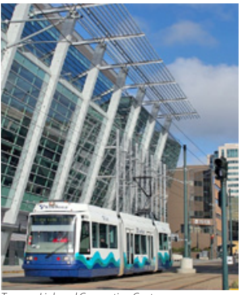
Tacoma Link and Convention Center

TOD has traditionally referred to an area served by rail, however a growing body of literature takes the view that modes of transit are less important than levels of service and accessibility.