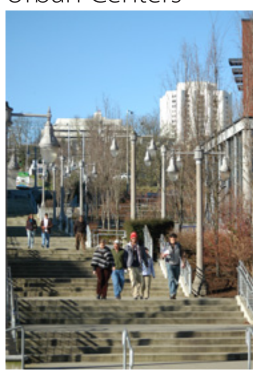
University of Washington, Tacoma Campus

The Puget Sound Regional Council describes urban centers as strategic places identified by GMA to receive a significant proportion of future population and employment growth compared with the rest of the urban area. Center locations are characterized by compact, pedestrian-oriented development, with a mix of different office, commercial, civic, entertainment, and residential uses. Urban centers play a key role in improving transportation across Washington's most densely populated regions, by offering opportunities to improve accessibility and mobility for walking, biking and transit. According to VISION 2040's Regional Growth Strategy, regional growth centers: