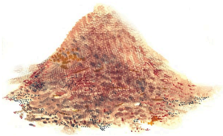
A single spoonful of soil contains 10,000 to 50,000 different types of bacteria. Illustration: Frances Marriott

Even much-loathed parasites are important. One-third could be wiped out by climate change, making them among the most threatened groups on Earth. But scientists warn this could destabilise ecosystems, unleashing unpredictable invasions of surviving parasites into new areas.