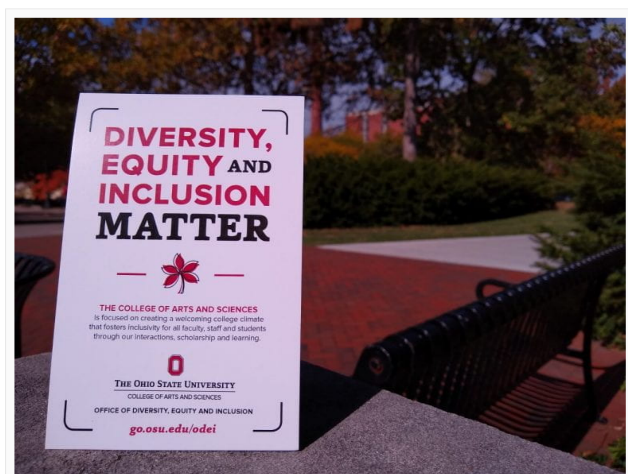
After nearly two weeks of nationwide protests, the Office of Diversity and Inclusion hosted a panel discussing ways that Ohio State can address racial injustice Monday.

After nearly two weeks of nationwide protests, the Office of Diversity and Inclusion hosted a panel discussing ways that Ohio State can address racial injustice Monday that drew almost 2,000 viewers.