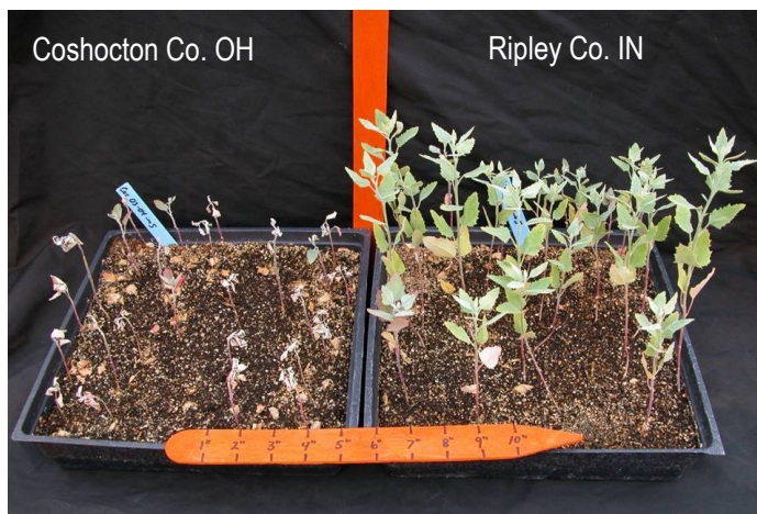
Response of two lambsquarters populations to glyphosate at 14 days after application.

Results represent the average of 5 sites in IN and OH, using lambsquarters populations with reduced sensitivity to glyphosate. Burndown = glyphosate + 2,4-D ester. PRE = Gangster.