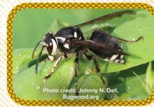
Bald-faced hornet Dolichovespula maculata 11–18 mm