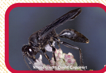
Great black wasp Sphex pensylvanicus 22–38 mm