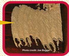
Mud dauber tubes