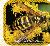
German yellowjacket Vespula germanica 8–18 mm