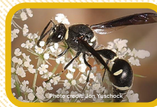
Potter wasp Eumenes fraternus 8–12 mm