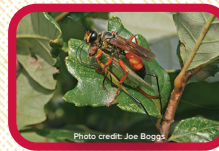
Great golden digger Sphex ichneumoneus 19–27 mm