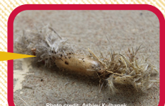
Grass carrying pupa (Pupa is often found in window sashes or in bee hotel tubes.)