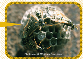
Paper wasp nest