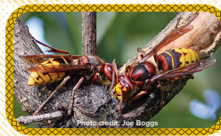
European hornet Vespa crabro 16–25 mm