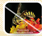
Wool carder bee: Not a wasp