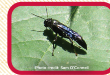
Pipe organ mud dauber Trypoxylon politum 13–22 mm