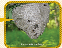
Bald-faced hornet nest