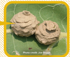
Potter wasp nest