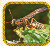
Northern paper wasp Polistes fuscatus 13–17 mm