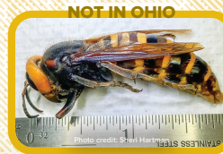
Asian Giant Hornet Vespa mandarinia 38–50 mm