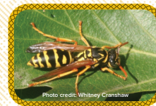
European paper wasp Polistes dominula 8.5–13 mm