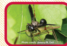
Grass carrying wasp Isodontia spp. 16–23 mm