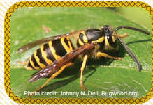
Eastern yellowjacket Vespula maculifrons 7–14 mm