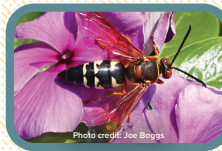
Cicada killer wasp Sphecius speciosus 21–40 mm