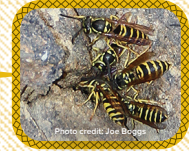
Yellowjacket nest entrance (Nests are in the ground or in a wall cavity.)