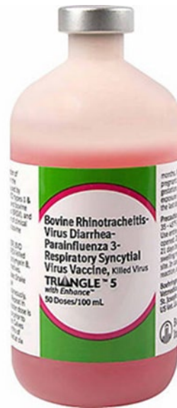
Figure 1: Examples of respiratory virus vaccines: Modified live or MLV (Bovi-Shield Gold 5/Zoetis); Killed (Triangle 5/Boehringer Ingelheim)