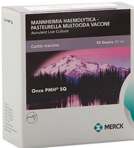
Figure 2: Examples of a combination MLV virus vaccine and "Pasteurella" (Vista Once SQ/Merck)-above and "Pasteurella" vaccine by itself (Once PMH SQ/Merck)-below.