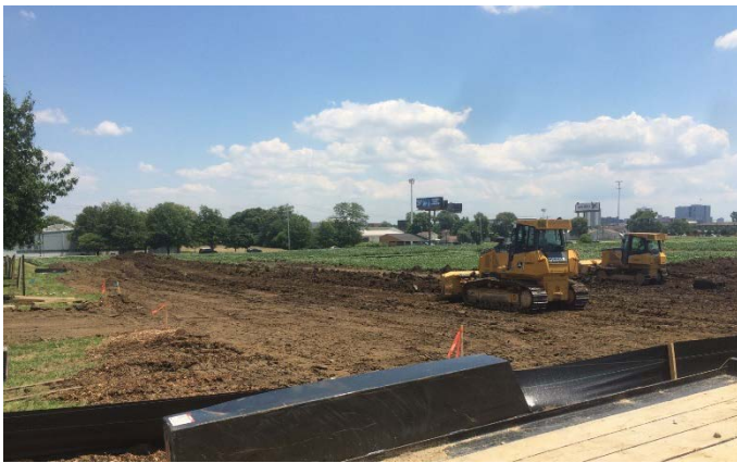
Construction Progress Photo of Kunz-Brundige Franklin County Extension Facility.