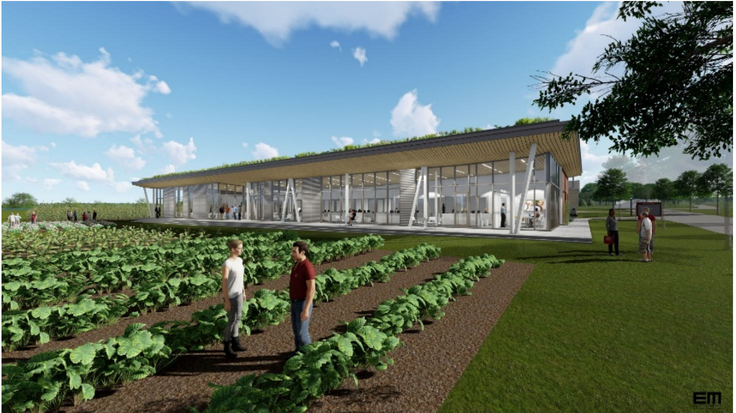
Architectural Concept for Kunz-Brundige Franklin County Extension Facility.