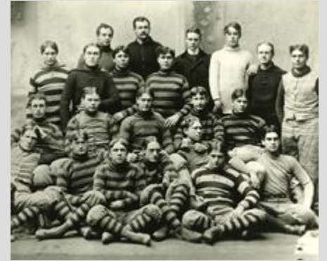
1897 Ohio State Football Team