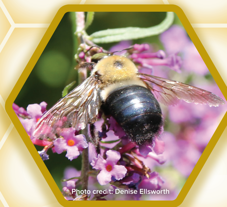
Large carpenter bee Xylocopa spp. Size: 15–23 mm