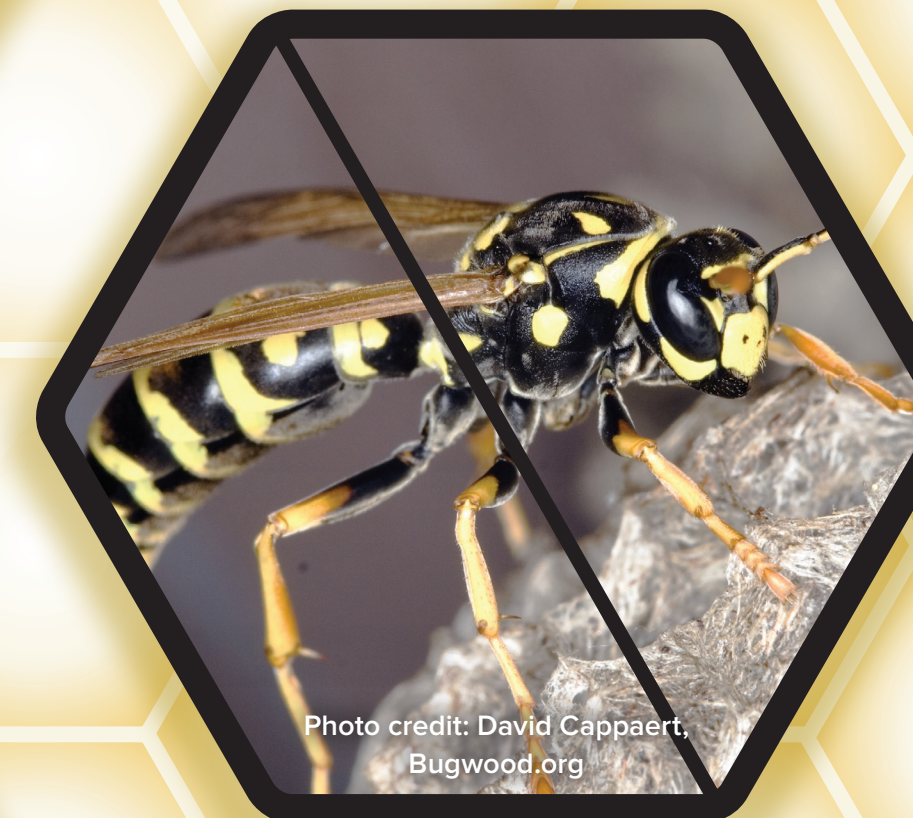
Wasp: Not a bee