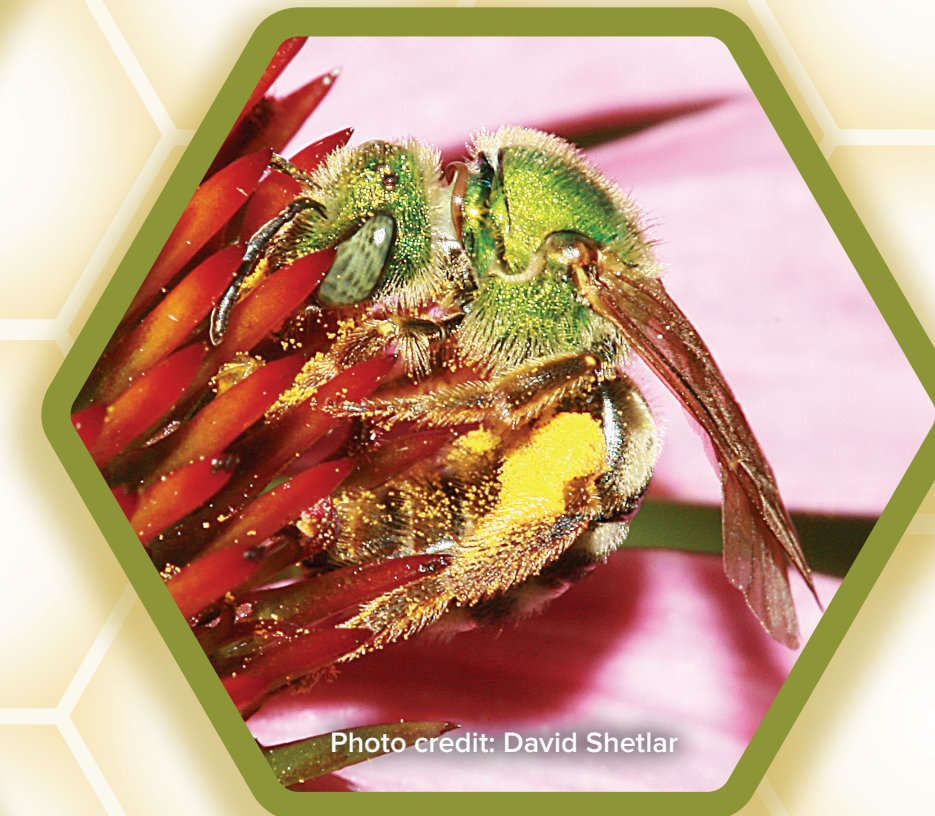
Green sweat bee Various species Size: 3.5–11 mm