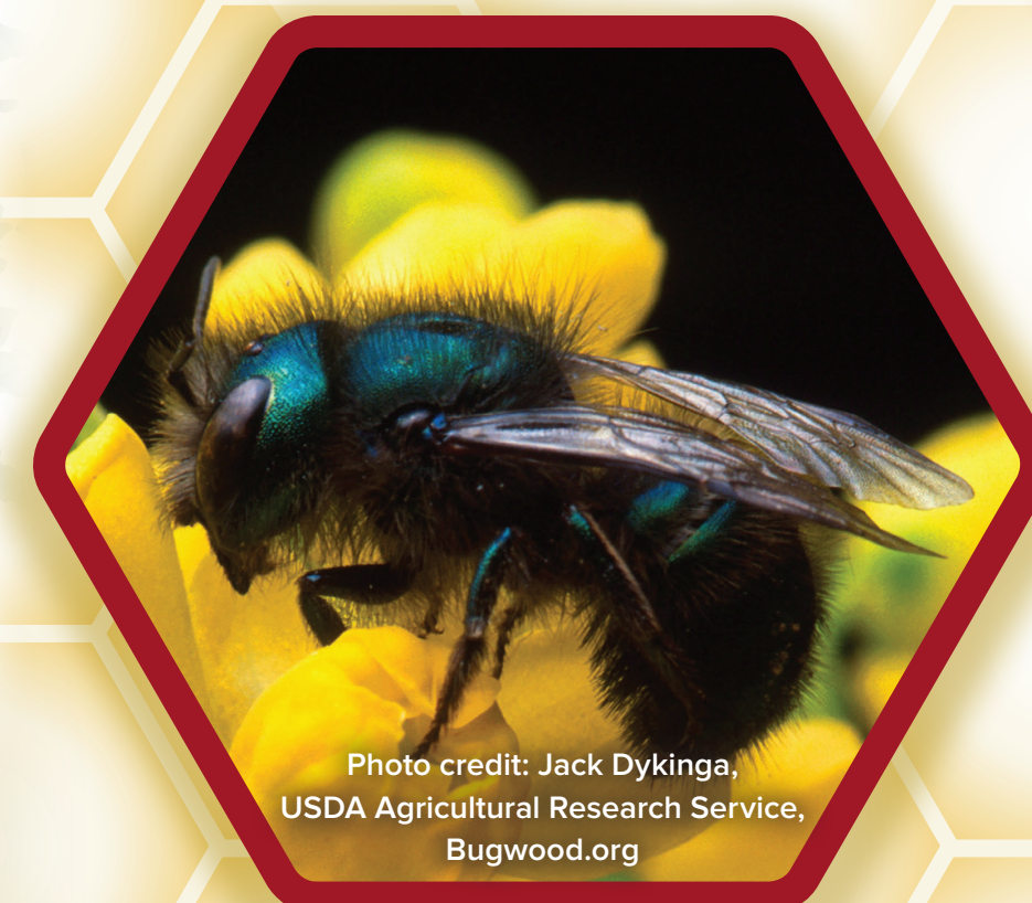
Mason bee (metallic form) Osmia spp. Size: 7–16 mm