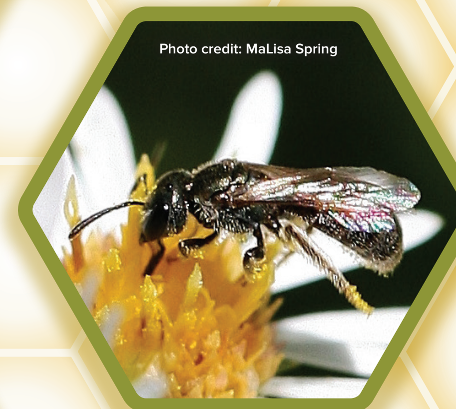
Dark sweat bee Various species Size: 3.5–11 mm