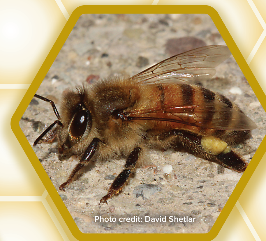
Honey bee Apis mellifera Size: 12–15 mm