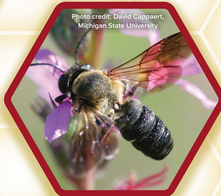
Giant resin bee Megachile sculpturalis Size: 13–25 mm