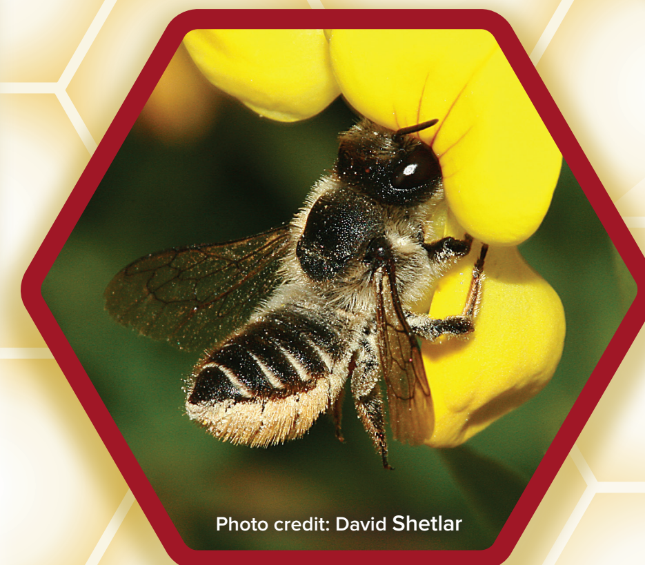
Leaf cutting bee Megachile spp. Size: 7–15 mm