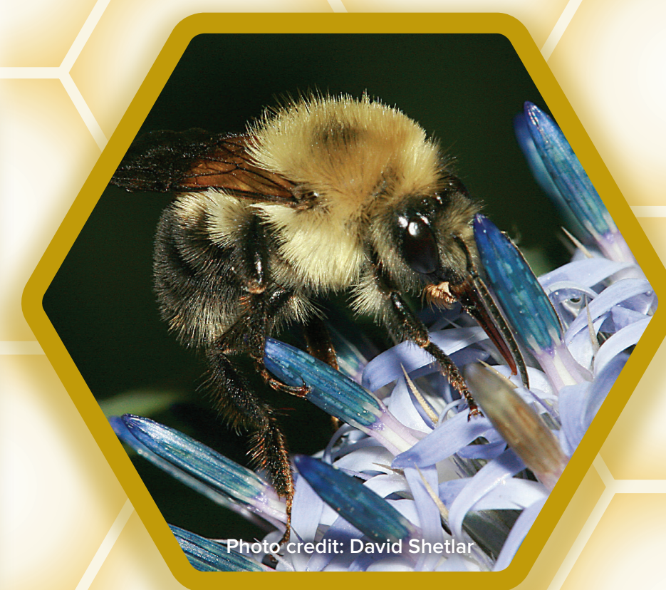
Bumble bee Bombus spp. Size: 8–21 mm