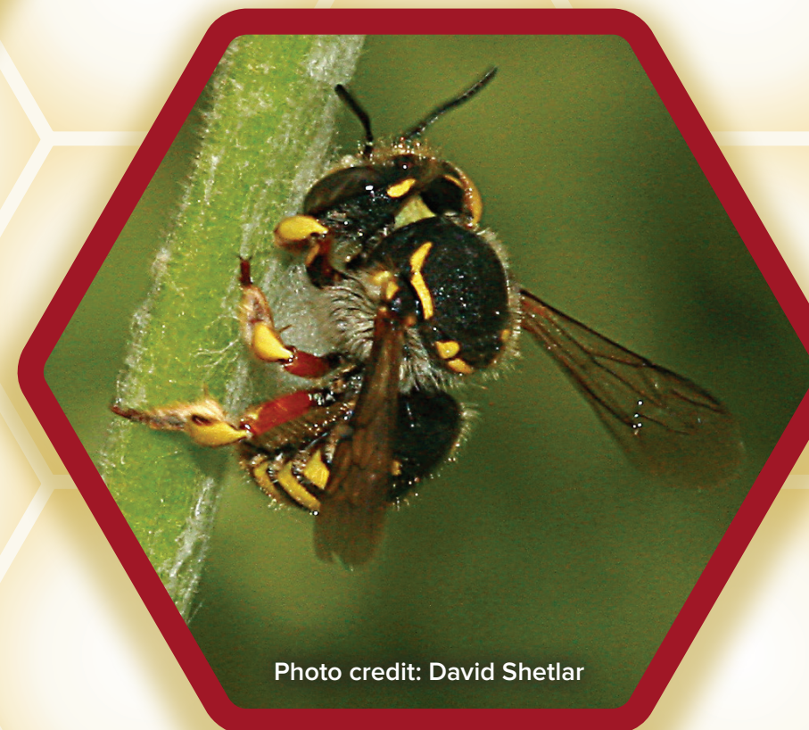
Wool carder bee Anthidium spp. Size: 11–17 mm