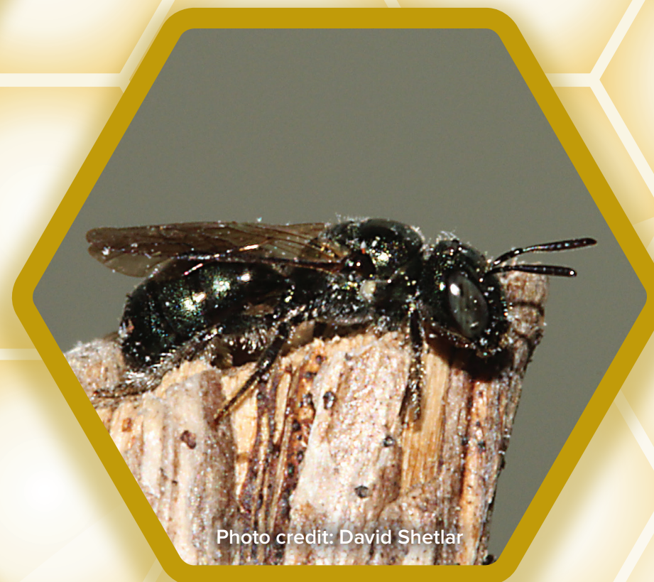
Small carpenter bee Ceratina spp. Size: 5–8 mm