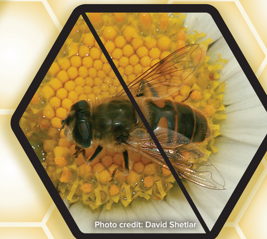
Fly: Not a bee