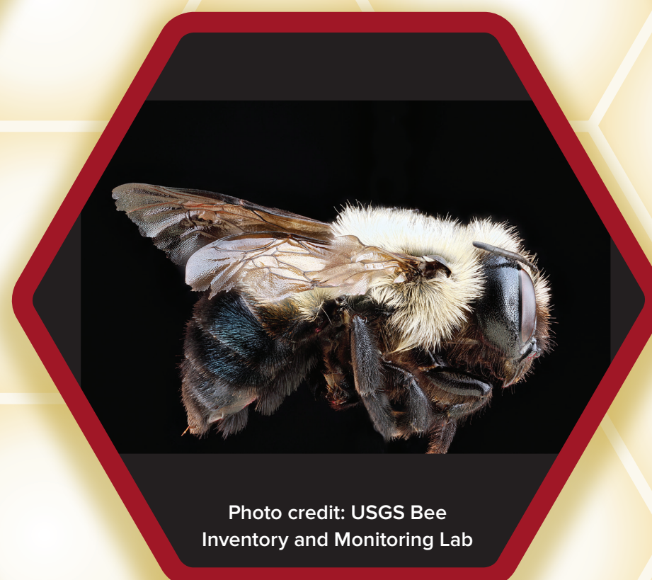
Mason bee Osmia spp. Size: 7–16 mm