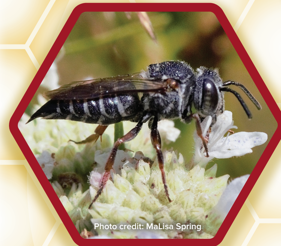
Cuckoo bee Coelioxys spp. Size: 7–10 mm