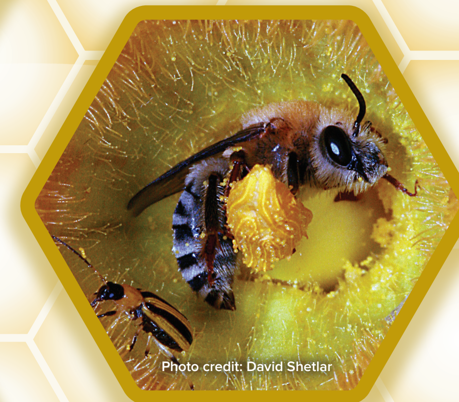
Squash bee Peponapis pruinosa Size: 11–14 mm