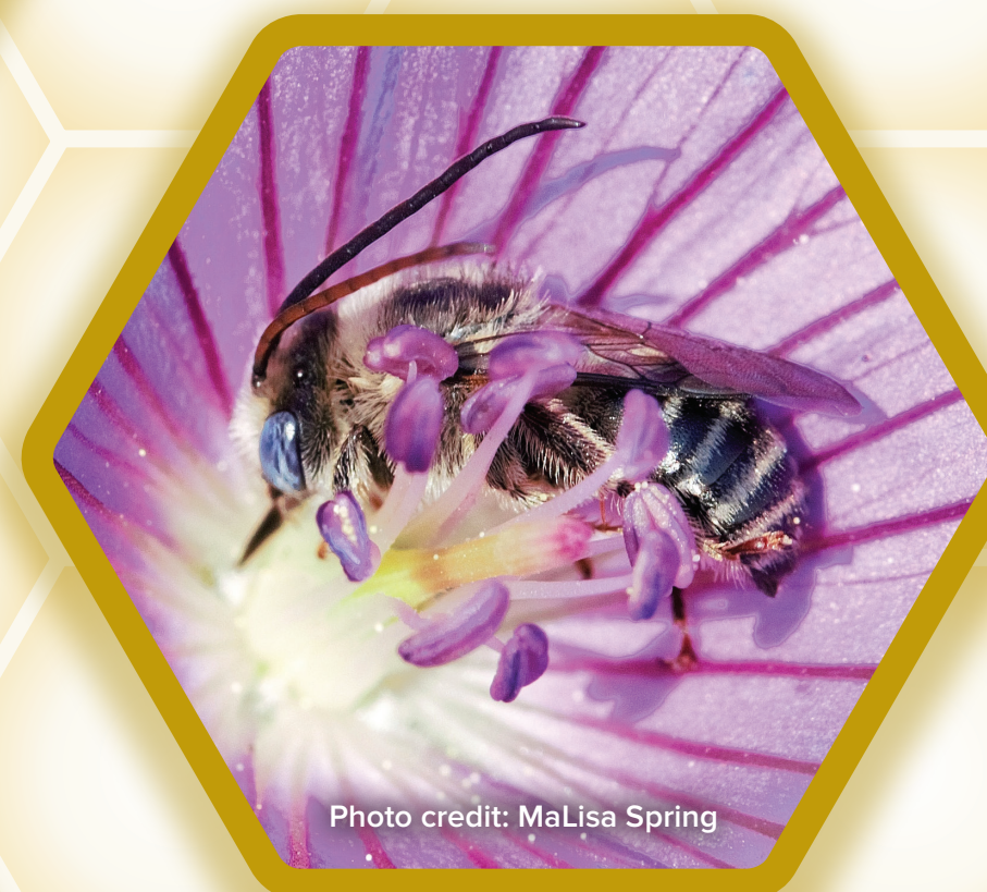
Longhorned bee Melissodes spp. Size: 8–16 mm