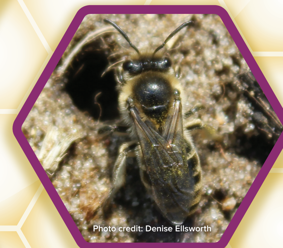
Polyester bee Colletes spp. Size: 8–15 mm