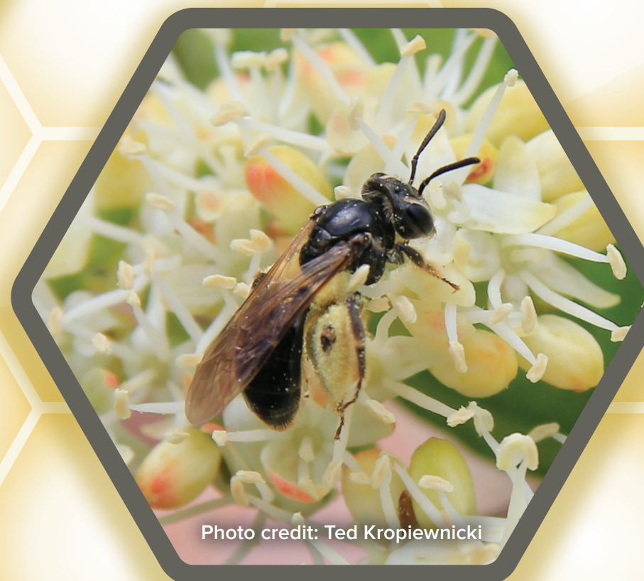
Mining bee Andrena spp. Size: 5.5–15 mm