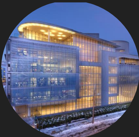
MIT Media Lab Employees