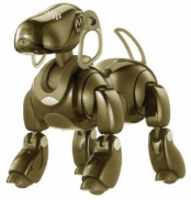
Figure 1. MIT researchers developed an approach to weight loss tracking that centered on a robotic dog (the Sony Aibo™ device that they utilized is shown above) [2]. The system is composed of a wireless pedometer and a PDA form for textual journal entry. The robot has wireless access to information from these devices and modifies its behavior depending on the user's information. One of the goals of this research is to help users be more aware of their fitness progress. Our system design was motivated in part by this same goal.

The process of journal keeping is another effective way of becoming aware of one's diet and exercise habits [5]. Many current journaling systems are implemented as web applications (e.g., www.fitday.com ). Such websites allow individuals to keep a textual log of what they eat and how they exercise. Visualization is usually provided using charts and graphs to show the user's progress over time. One drawback for the user is that when they do not have internet access during the day, they may need to keep a mental or written record of their activities until they are able to login to the application. The Fitlinxx system partially removes that burden by automatically tracking workouts on gym exercise machines ( www.fitlinxx.com ). In our design we have tried to further compensate for this problem by utilizing the cell phone platform, a device that many people have with them continuously throughout the day.