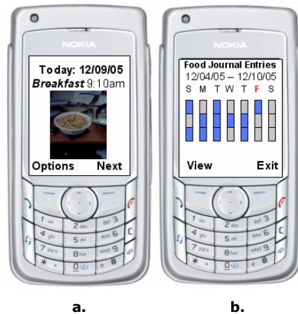
Figure 2. 2 screenshots of the FotoFit cell phone interface.

b. Users can see which meals they have taken pictures of. This can be useful if the user wants to see which days they forgot to eat breakfast. Each day starts off as a grey bar with three segments, the bottom corresponding to breakfast, the middle to lunch and the top to dinner. When a food entry is added, the corresponding segment of the bar is colored.