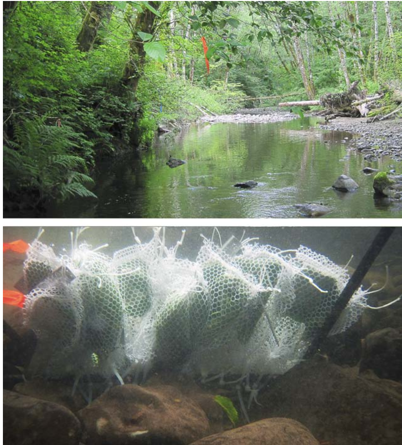
PLATE 1. (Top) Typical river reach and (bottom) example of leaf pack deployment system for experimental study of stream community adaptation to leaves of individual red alder ( Alnus rubra ) trees. Note the branches of red alder hanging over the river (foreground of top photo) and the fallen green leaf of a red alder lying on the stream bed (bottom photo).

selection should drive community composition to consist of organisms that can efficiently feed on the most commonly available resources. We found that aquatic decomposers do indeed process locally derived leaf litter significantly faster than leaf litter originating from other riparian zones, a pattern consistent in two independent reciprocal transplant experiments using a pair of two small rivers and a pair of two medium-sized rivers.