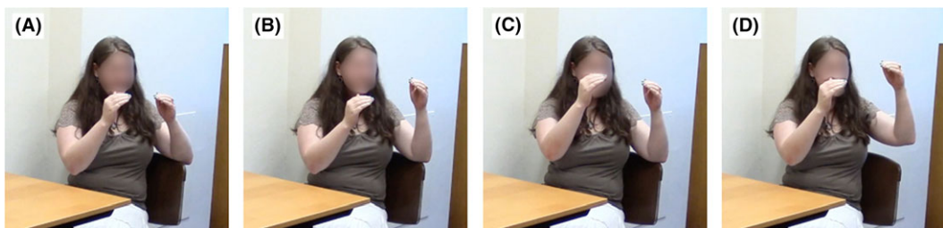
Fig. 4. Examples of an analogical model in gesture, produced during an explanation of a positive feedback system. A first gesture (A) establishes the causal factors as locations in space; three subsequent gestures represent increases to the first factor (B), the second factor (C), and then the first factor again (D), as upward movements.