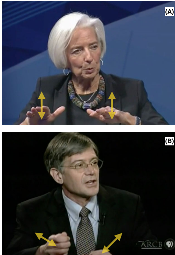
Fig. 2. Two examples of gestures produced to represent the notion of a “trade-off.” Both examples involve alternating motions of the hands, thus capturing the idea that, as one entity changes, another changes in the opposite way.

For comparison, consider another example of a gesture representing the notion of a trade-off, also involving an alternating movement pattern (see Fig. 2B). In this case, James Steinberg, former Deputy Secretary of State, is making the point that the interests