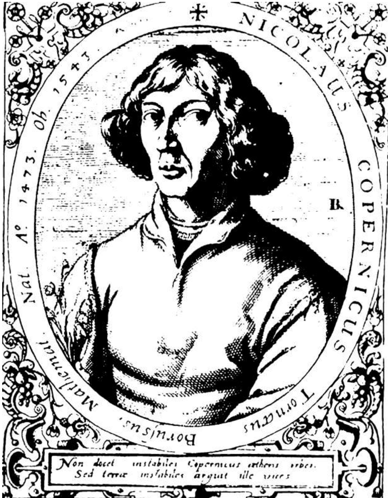
Copernicus, Nicolaus. Nicolai Copernici Toriensis De Revolutionibus Orbium Coelestium . Norimbergae: Apud Ioh. Petreium, 1543. https://asa.lib.lehigh.edu/Record/297634