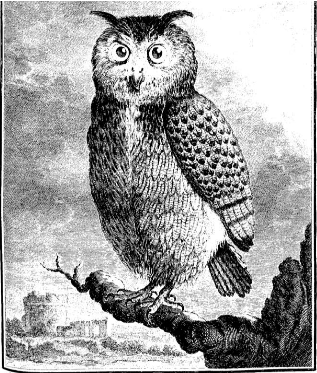
Le Grand Duc.

Buffon, Georges Louis Leclerc, M. 1716-1799 Daubenton, Philibert Guéneau de Montbéliard, and M. le comte de 1756-1825 La Cépède. Histoire Naturelle, Générale Et Particulière, Avec La Description Du Cabinet Du Roi. Paris: De l'Imprimerie royale, 1749. https://asa.lib.lehigh.edu/Record/258156