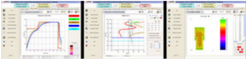
Figure 1. CHT-q/t user interfaces

CHT-q/t integrates all of the heat treatment process i.e., heating, quenching and tempering. CHT-q/t is built with six major modules and every module is supported with several comprehensive databases. The major modules are Workpiece enmeshment module, Heating module, Quenching module, Microstructure and Phase transformation module, Tempering module and Mechanical properties module.