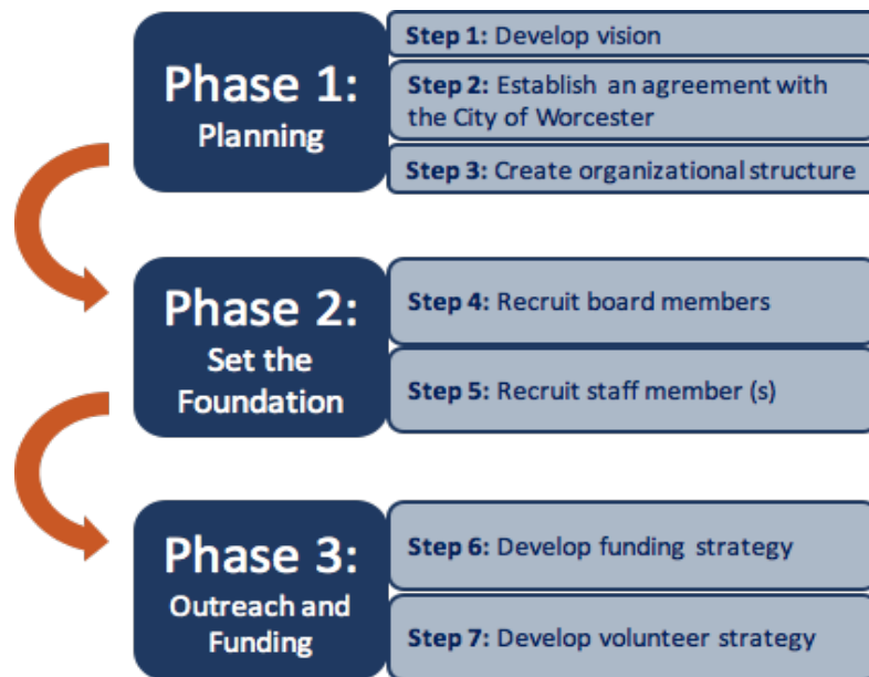
Figure 1: The Phases and Steps of the Development of the EPC